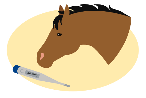
During isolation, check the horse regularly for symptoms such as a cough, nasal discharge or a fever.