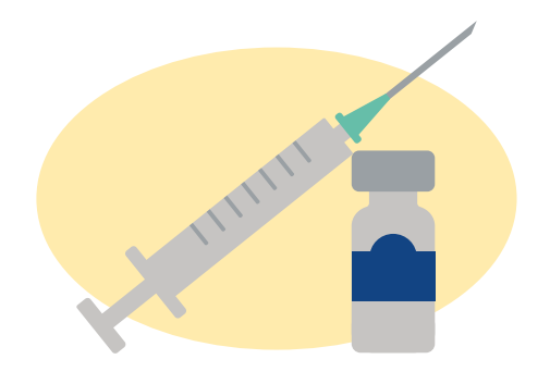
Check the horse's vaccination status – up-to-date flu vaccination should be a prerequiste for all new arrivals.

The following advice is designed to help you to reduce the risk of introducing infectious disease onto your yard through the arrival of new horses or short-term visitors.