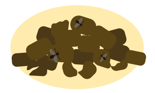
Don't spread manure from isolated horses onto fields to reduce the risk of introducing resistant parasites.