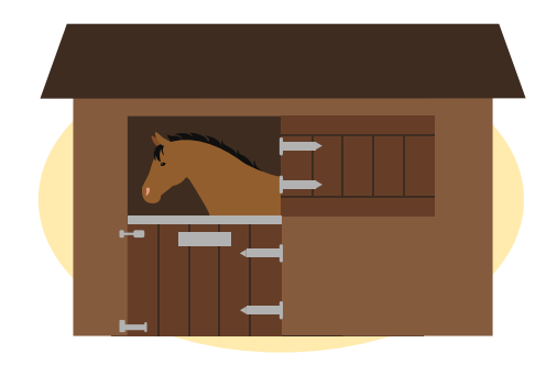
Isolate the new horse for two to three weeks to ensure that they aren't incubating disease.